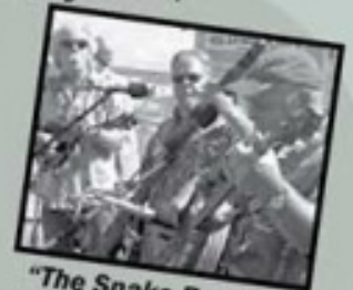
"The Snake Brothers"

Visit our website for registration forms for Artists, Craftsmen, Photo Contest & Other Information.